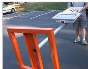
One-person operation to tilt and roll to a new location