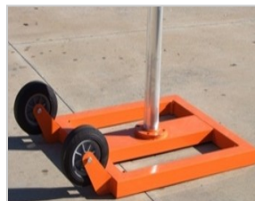
Angled wheels ensure stability and easy-tilt when ready to move